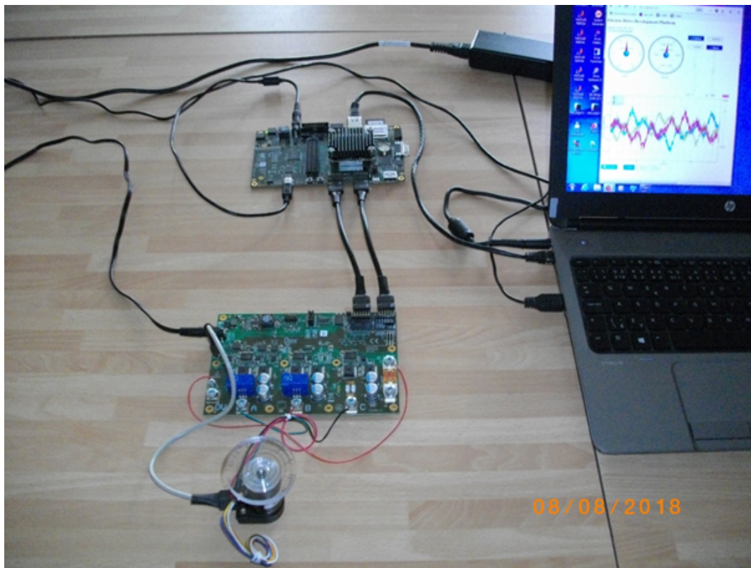
3-phase brush-less DC motor control with field oriented control (FOC) algorithm implemented in SDSoC 2017.1 on TE0720 module and TE0701-06 carrier board. The TEC0053-04 - EDPS Power Stage controls the BLDC Motor with mounted Encoder.

The following steps are describing how to connect and setup hardware parts shown in the Figure above.